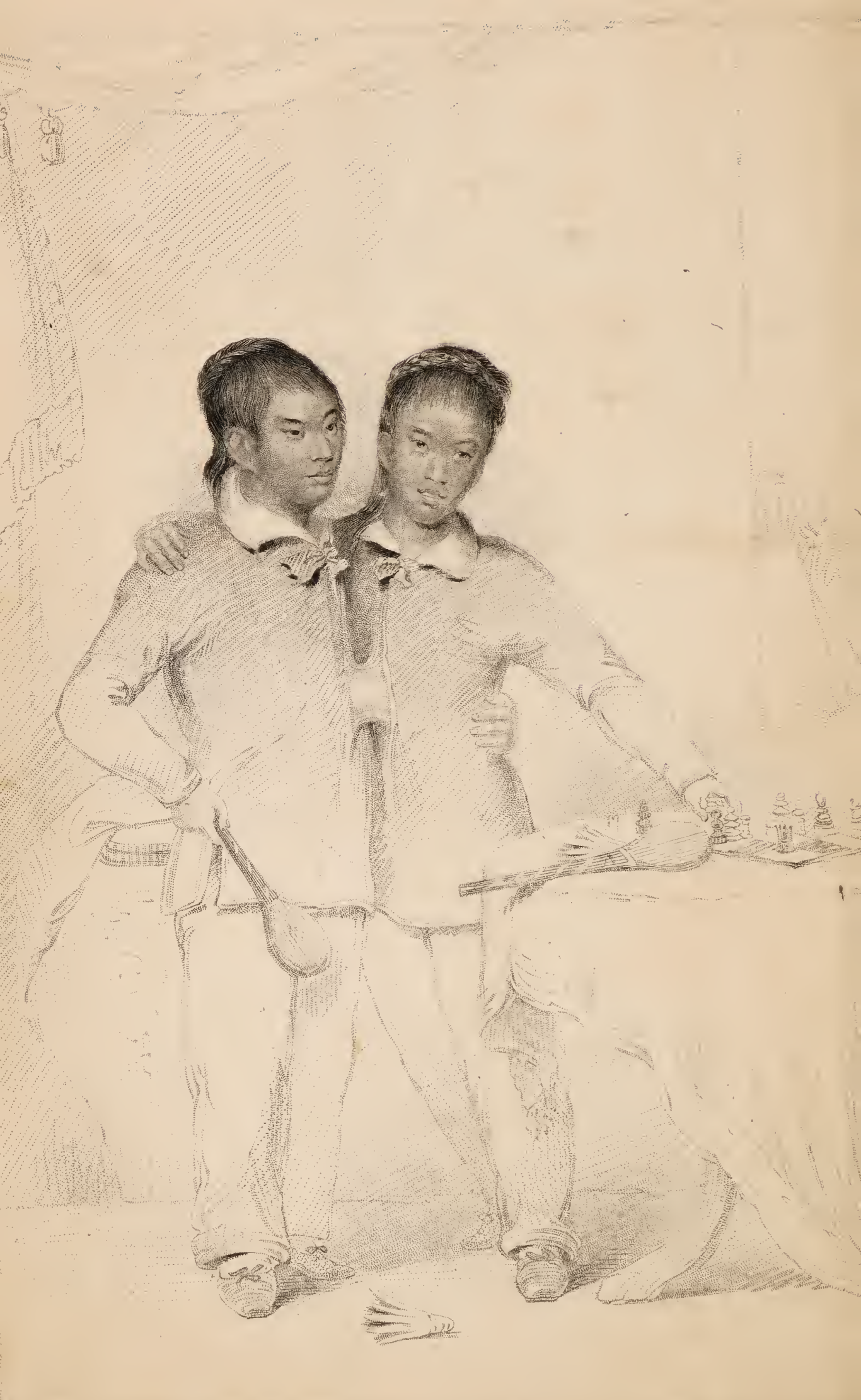
ENG and CHANG, THE CELEBRATED SIAMESE YOUTHS.